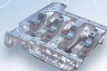
Lower Engine Blocks